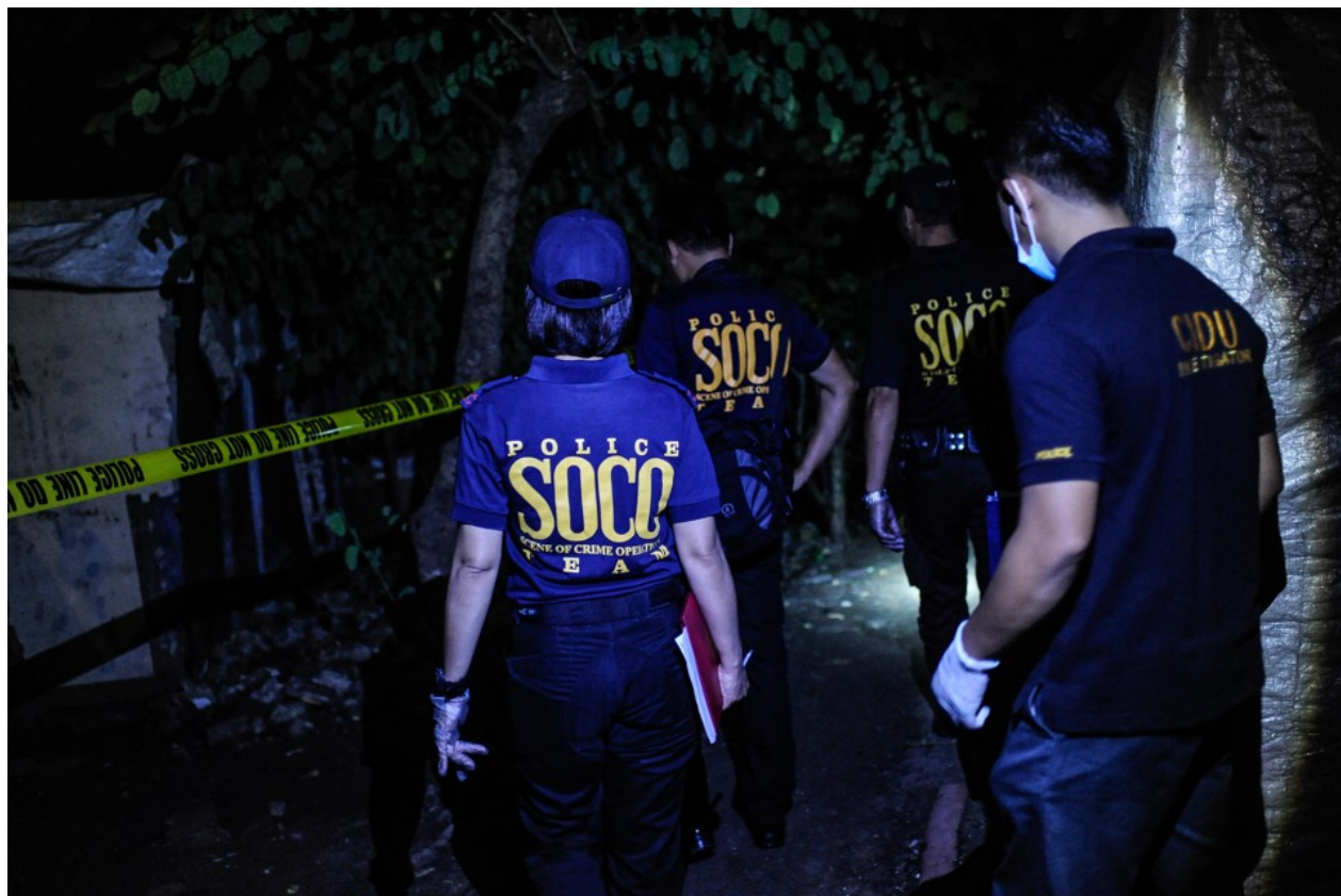
Police forensic teams inspect evidence after an operation in which three suspect drug dealers were killed in Manila in June 2016.