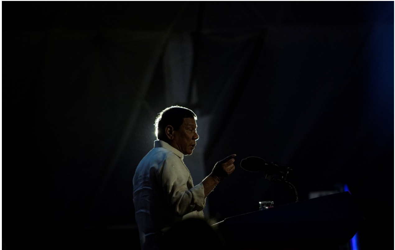
Duterte delivers a speech in March 2017, warning major media outlets of repercussions for critical coverage of his drug war.

Senate in May, candidates who backed his drug war fared well, topping the polls even in the shantytowns where suspects were being gunned down.